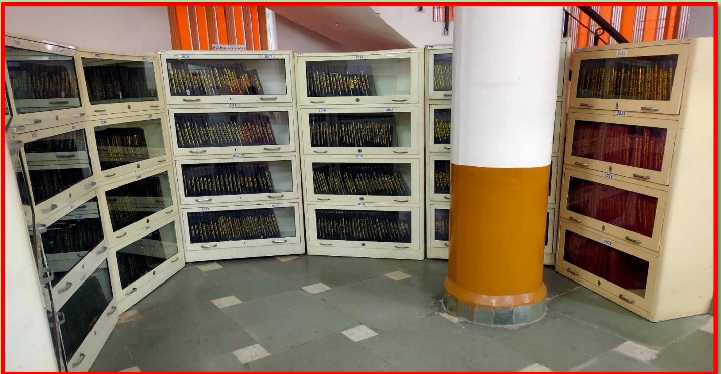
Bound volumes of journals of previous years